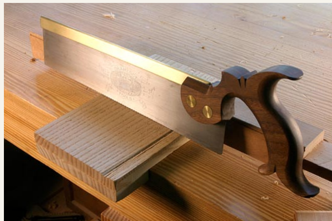
TOOLS FOR WORKING WOOD ■ 800-426-4613 ■ toolsforworkingwood.com

come). The Gramercy is definitely not an also-ran. Its distinct set of features have launched it into the very top tier of makers and deserves your careful consideration.