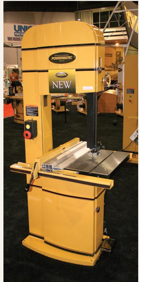
POWERMATIC ■ 800-274-6848 ■ powermatic.com

Priced at about $4,000, it's at the upper end of the market, but it will be the last band saw you ever buy.