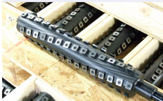
BYRD TOOL ■ 800-441-2973 ■ byrdtool.com

Until now, these cutterheads were available only for bigger machines. Now Byrd Tool has begun making aftermarket Shelix heads for some portable planers, including the DeWalt 13" DW735. And others are in the works, including Ridgid and Delta planers. At about $410 for a Shelix replacement head, it might be better to update your existing planer than replace it. PW