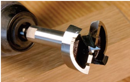
COLT ■ Available this fall from specialty stores

We tried to overfeed this bit, and we failed. Bravo to Colt. These bits cost a little more, but we think they're worth it.