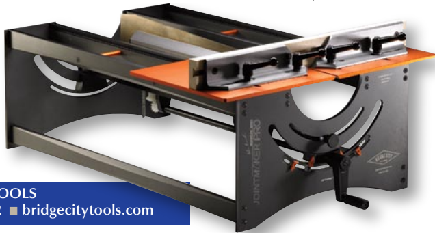
BRIDGECITYTOOLS ■ 800-253-3332 ■ bridgcitytools.com

The tool is made to exacting standards from high-quality and durable materials. The base model costs $1,095.