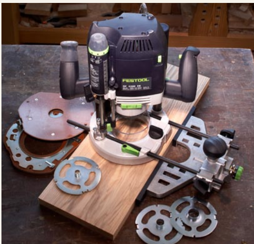
FESTOOL USA ■ 888-337-8600 ■ festoolusa.com

Festool just forced the plunge router to evolve again. Now watch everyone else try to keep up.