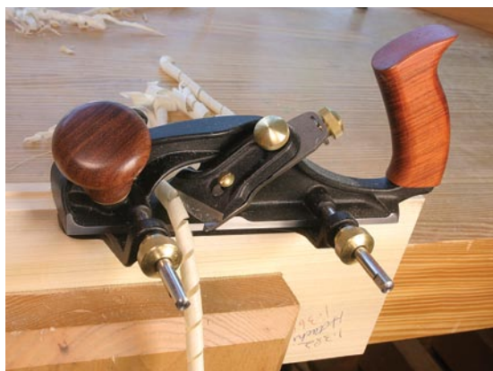
LEE VALLEY TOOLS ■ 800-267-8735 ■ leevalley.com